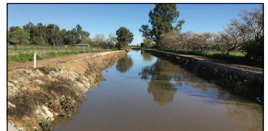
Groundwater recharge in the YCFC&WCD canal system.

Davis, City of Dunnigan Water District Reclamation District 108 Reclamation District 2035 University of California, Davis West Sacramento, City of Winters, City of Woodland, City of Yolo County Yolo County Flood Control & Water Conservation District