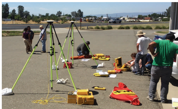
Subsidence monitoring training day for cooperating agencies

City of Woodland's Recycled Water Project The $5.75 million Recycled Water Project provides tertiary treated effluent for parks irrigation and other acceptable uses, while reducing the demand on treated surface water during dry periods. The City is one of the few recycled water permittees in Northern California. The project was funded through a mixture of grants and State Revolving Fund loans reducing the impact to current and future sewer rates. This project aligns with the completion of the Woodland-Davis Clean Water Agency's (WDCWA) Regional Water Treatment Facility that came online in June 2016. This Facility brings high-quality, treated Sacramento River water to the cities of Davis and Woodland; one of the few California cities that relied entirely on groundwater supplies. Reclamation District (RD) 2035/Conaway's Joint Surface Water Intake & Fish Screen Facility is a state-of-the-art surface water intake on the Sacramento River that provides benefits to agriculture, the environment and local municipalities. Backed by historic joint construction and operation agreements between the Conaway Preservation Group and WDCWA, the intake facility replaces the largest unscreened surface water diversion on the Sacramento River. For more details on both of these WDCWA projects visit www.wdcwa.com .