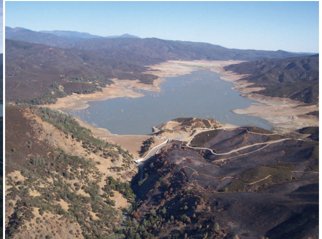
Comparative photos of Indian Valley Reservoir (IVR), Lake County, managed by the YCFC&WCD. Photo on left illustrates approximately 286,700 acre-feet in 2006 (maximum storage capacity 300,600 acre-feet). Photo on right shows IVR at approximately 28,000 acre-feet in 2008. As of 11/28/14, IVR was at 23,433 acre-feet.